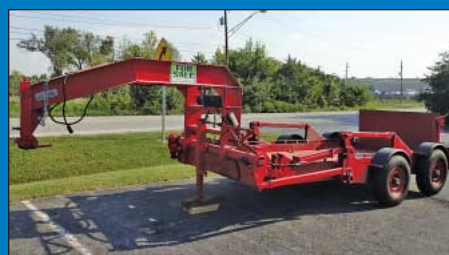
216' GE Copper Buss Duct, Misc. Fabrication Machinery, 15,000 LB Cat LP Gas Lift Truck, 1999-14' Life Time Hydraulic Platform Trailer