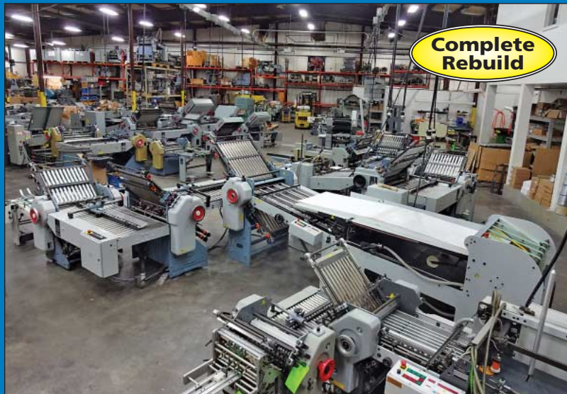
26" X 40" Stahl Model TD-66/6-4-RD-T Continuous Feed Folder