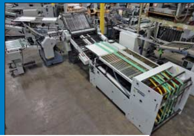
Stahl and Heidelberg Pile Feed Folders, 26" X 40" Stahl TD-66 Continuous Feed Folder w/ (6) Plate Main, 30" X 50" Heidelberg Folder