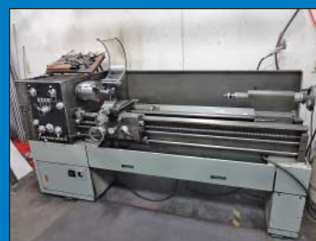
Heidelberg QM-46 Press, Kluge, 3HP Super Vertical Mill, 20" X 60" Takang Gap Bed Lathe, 15" X 50" South Bend Lathe